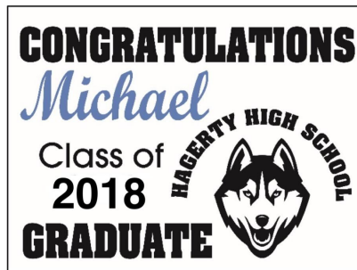
(sample with no icons)

Yard Signs may also be ordered online at http://hagertyhighptsa.weebly.com