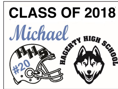
(sample with icon..may pick 1or2)

Name on sign? Y or N If Y, name as it should appear on sign: _____ (First Name Only)